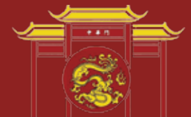
南澳州阿德萊德中國城協會 Chinatown Adelaide of S.A. Inc.